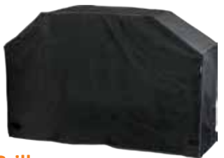
Grillman 6 Burner BBQ Hood Cover 289757