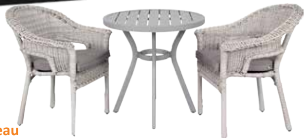
Nouveau Canzo 3PC Dining Setting !88483