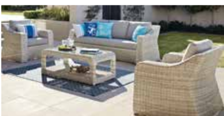
'Sicily' 4-Piece Outdoor Lounge Setting.