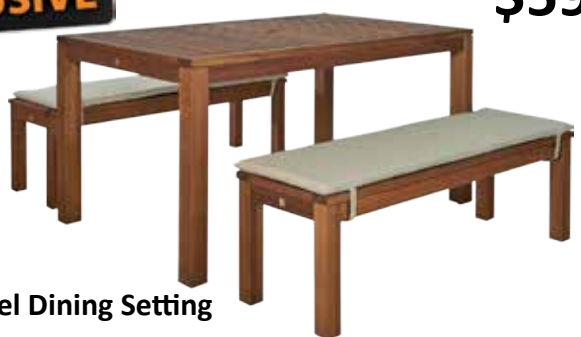
Nouveau 3PC Carmel Dining Setting !88501