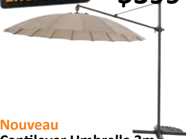
Nouveau Cantilever Umbrella 3m Taupe 202112