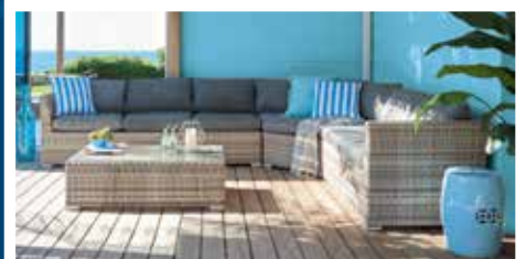
'Tahiti' Outdoor Corner Lounge Setting.