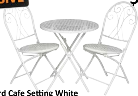
Nouveau 3PC Whitford Cafe Setting White 202007