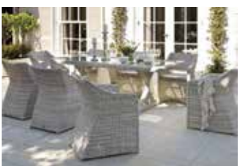
'Sicily' 9-Piece Outdoor Dining Setting.

Transform your outdoor living space into a summer retreat