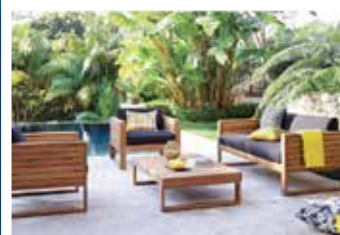
'Vanuatu' 4-Piece Outdoor Lounge Setting.