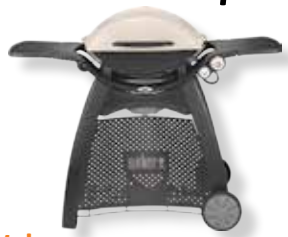
Weber Family Q3000 BBQ Titanium 239459