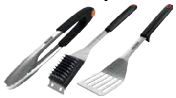
Grillman 3PC Stainless Steel BBQ Tool Set 249038