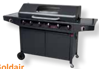
Goldair 6 Burner Hooded BBQ Dark Grey 304220