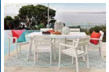
'Vertigo' 7-Piece Outdoor Dining Setting.