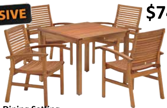
Nouveau 5PC Carmel Dining Setting !88499