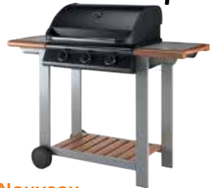
Nouveau 3 Burner BBQ 289049