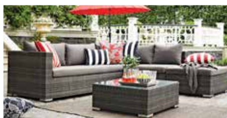
'Malibu' Outdoor Corner Lounge Setting.