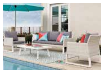
'Vertigo' 4-Piece Outdoor Lounge Setting.